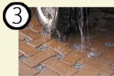
pervious pavers on driveway