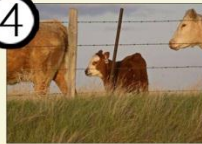
cattle exclusion fencing