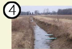
farm tiles drain into stream/ditch