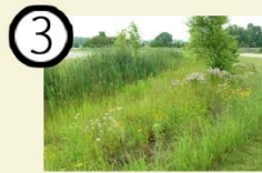
native planting areas