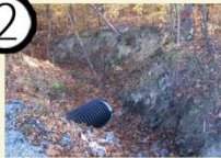
intercepted drain tiles