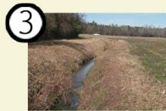
no stream/ditch buffer